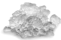
MF 46 Superflake ice Residual water content 15%