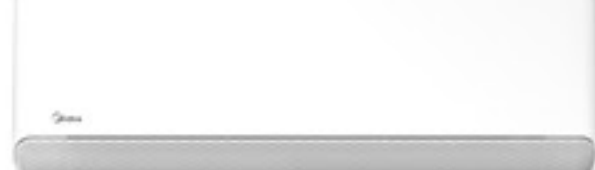
The Breezeless E

The new Breezeless E with an outdoor unit featuring innovative anti-corrosion technologies